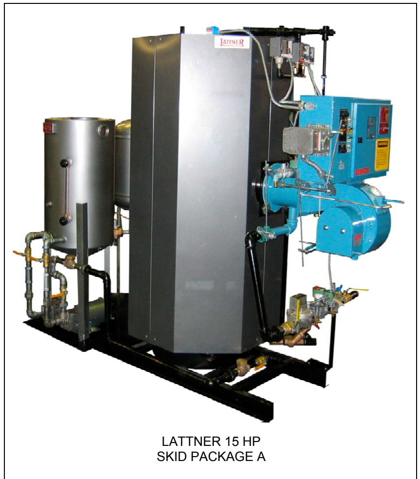
LATTNER 15 HP SKID PACKAGE A